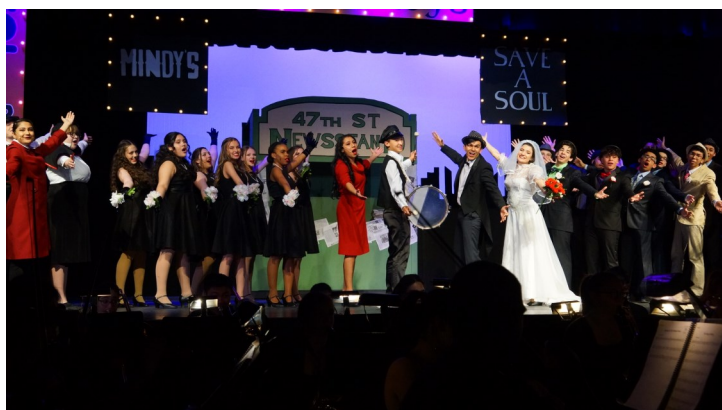
Pictured above: The cast of Guys and Dolls .

Guys and Dolls ran from March 8th through the 10th. Congratulations to all of the hard working students, crew, and teachers for their dedication and commitment to putting on a wonderful show.