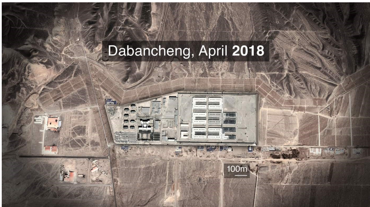
Image: A cnn.com satellite image of Dabancheng, one of several internment camps in China.

US Secretary of State Mike Pompeo condemned the 're-education camps' in China. However, the world depends on the The Commander-in-Chief of the free world to take action. A New York Times piece by The Editorial Board highlighted the need for President Donald Trump to meaningfully address acts of oppression directed to the Uighur people. They argue that unlike President George H.W. Bush who had the political acumen to challenge China following the Tiananmen Square Massacre, President Trump has no experience in this delicate space.