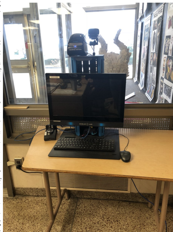
One of the bases for Hicksville's new Scholarchip system.