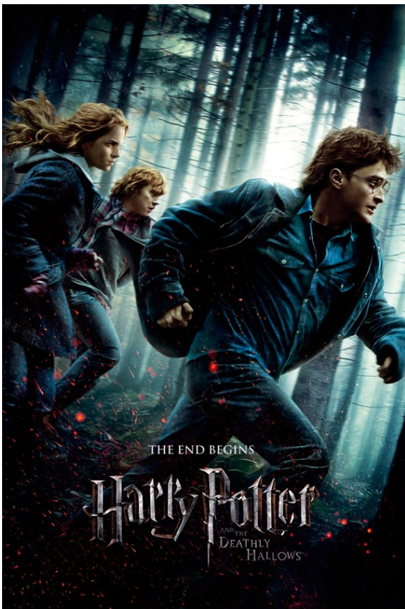
Pictured above: Harry Potter and the Deathly Hallows Part One poster

The first Harry Potter book may have been written 20 years ago, but the lessons we can learn from the series are timeless. While Harry Potter may live in a fictional world filled with wizards and witches, he faced obstacles and hardships, just like the rest of us, and he overcame them. Harry Potter was a high schooler, just like we are right now, and he faced some very common problems that we face today. The Harry Potter series continues to teach us that we need to have faith in ourselves to defy the odds, even when others do not have faith in us. The relevance of Harry Potter will continue to resonate with us for years to come.