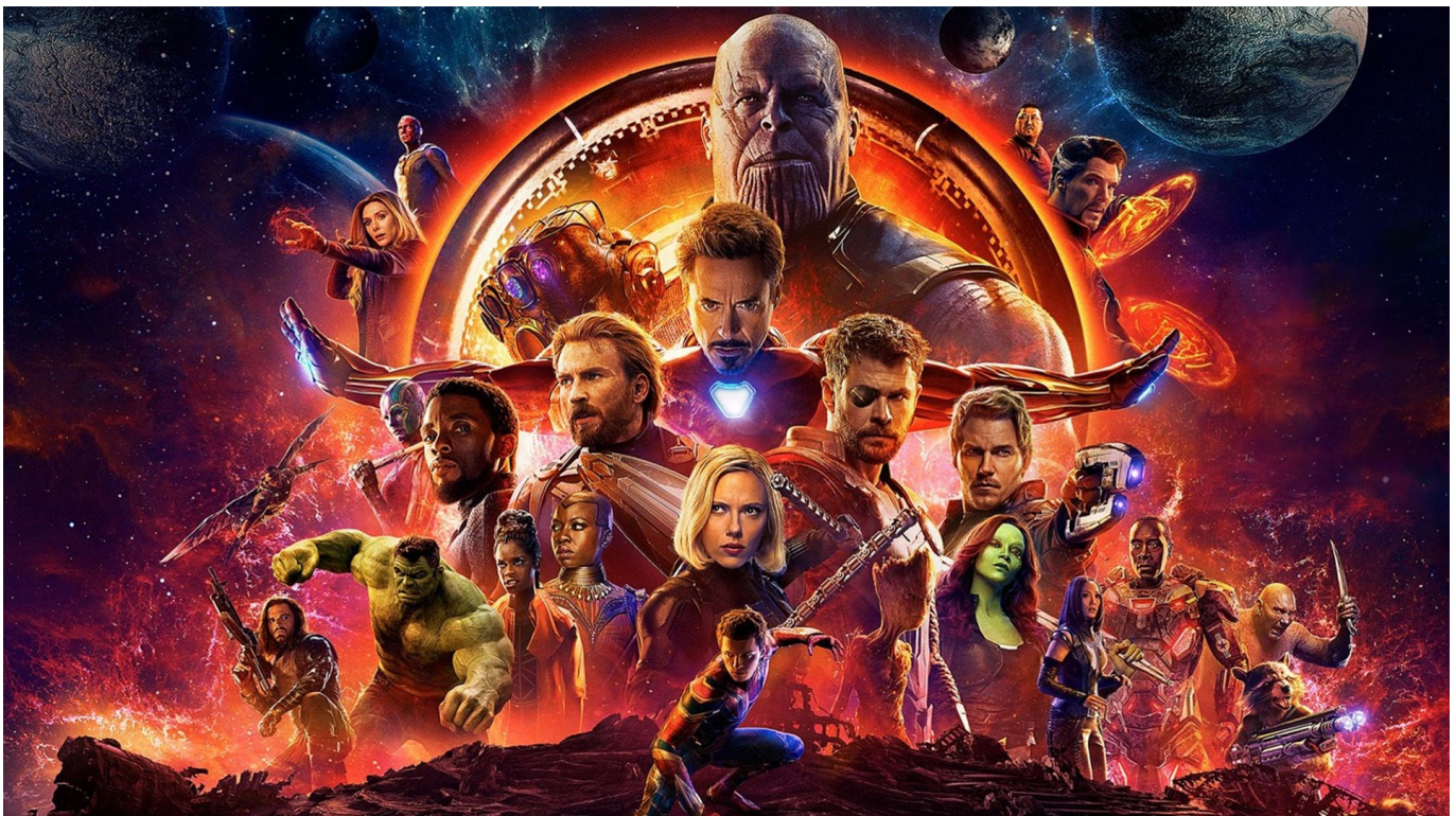
Promotional poster for Avengers: Infinity War

The creator of many of these characters, Stan Lee, passed away on November 12, 2018. Lee died at the age of 95 at Cedars-Sinai Medical Center in Los Angeles, California, after being rushed there in a medical emergency earlier in the day. Where the MCU goes without his guidance and supervision is hard to predict. Lee was a not only man, but a legend to many comic book aficionados. Lee created most of the Marvel characters and he cameoed in many Marvel movies.