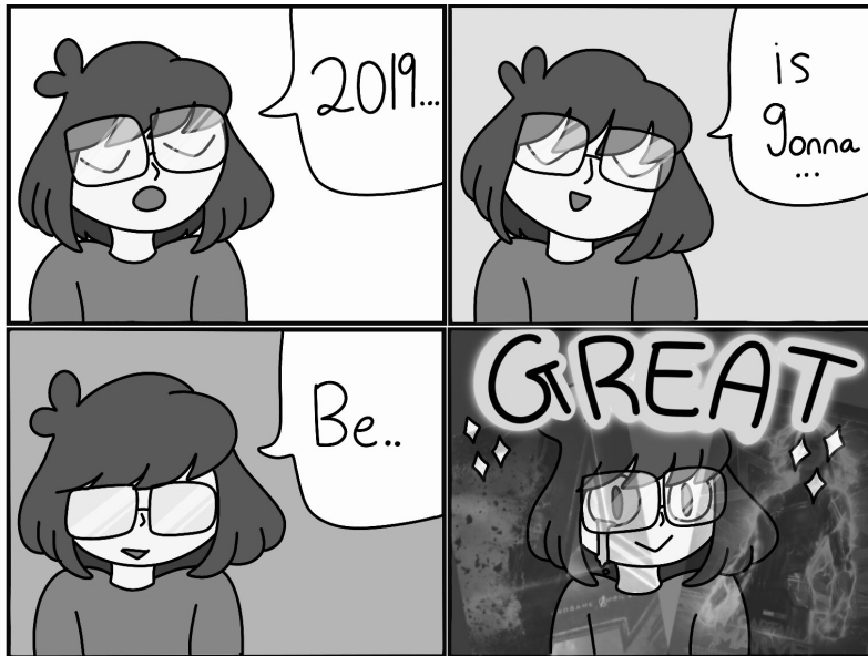
'2019 is going to be great... right?'