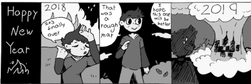
By: Sage Boiko