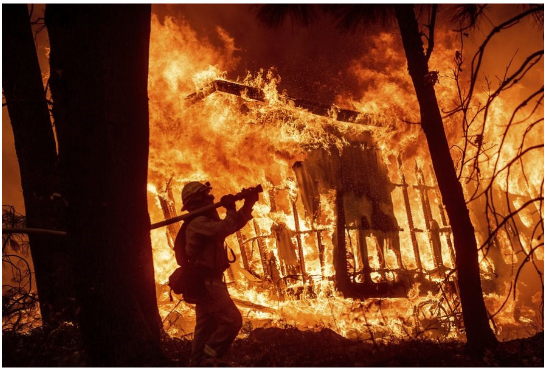
Wildfires destroy a home in Butte County.

These fires are an incredibly dangerous and scary adversary to California. Wildfires typically occur in wooded areas near heavy populations, which puts more families and homes at risk.